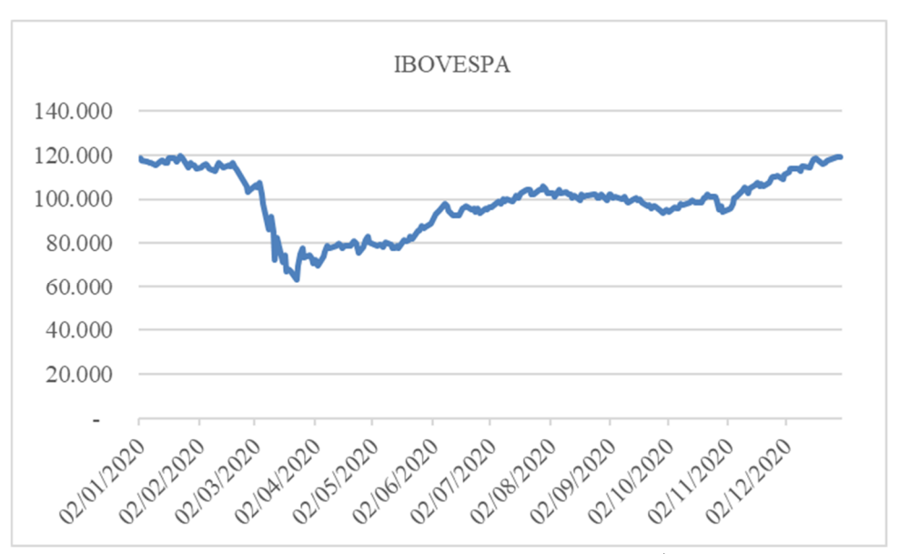
Figure 1. IBOV 2020 evaluation in Brazilian Reais (R$)

From the worst day in March until the end of 2020, Ibovespa recovered and increased, closing at 119.238 ppt. The IBOV evaluation during 2020 is presented in Figure 1.